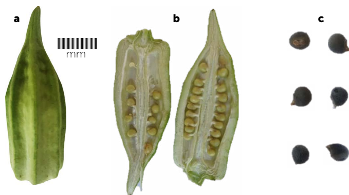
Figure 1. Fruits and seeds of okra [ Abelmoschus esculentus (L.) Moench]. a) complete fruit in physiological maturity, b) fruit split longitudinally with arranged seeds, c) dehydrated seeds in different positions, with the micropyle exposed.

loam clay soils; likewise, the number of seeds also varied, with a lower count in fruits with lower weight and size.